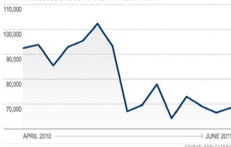
BANK REPOSSESSIONS DOWN 29% YEAR-OVER-YEAR

©2011, All rights reserved The Hershman Group www.Originationpro.com